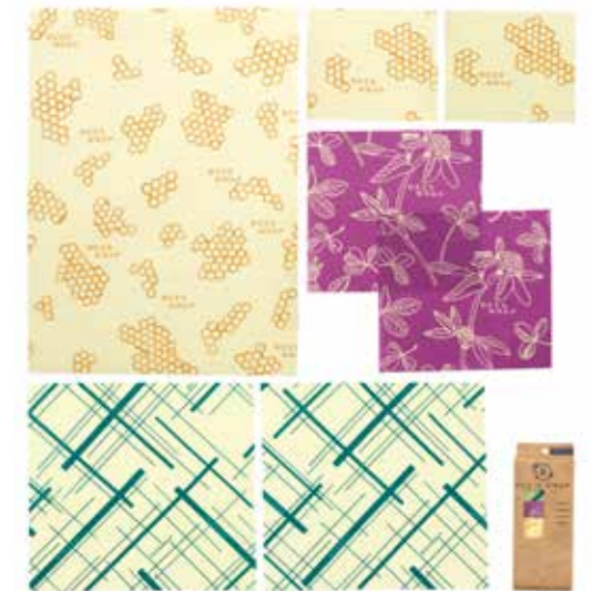
#VP0007 | VARIETY 7 PACK

Includes: 2 small honeycomb, 2 medium clover, 2 large geometric, 1 bread honeycomb