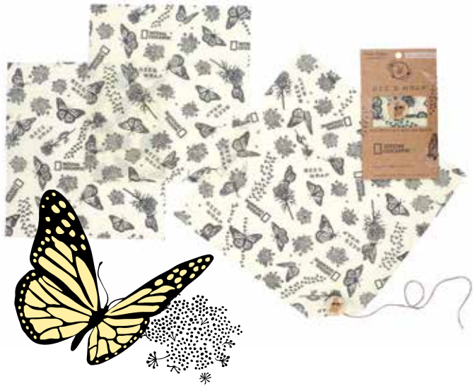
#EXP003 | EXPLORER PACK Monarch Print

Includes: 1 sandwich wrap with wooden bee button and hemp twine and 2 medium wraps